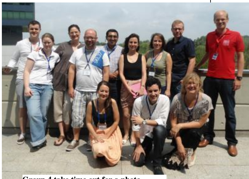
Group 4 take time out for a photo