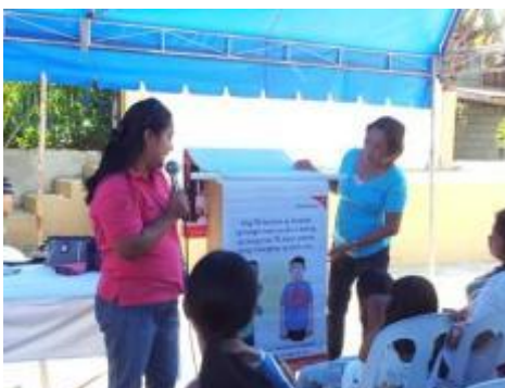
Lay fora on various topics such as lung health and wellness.