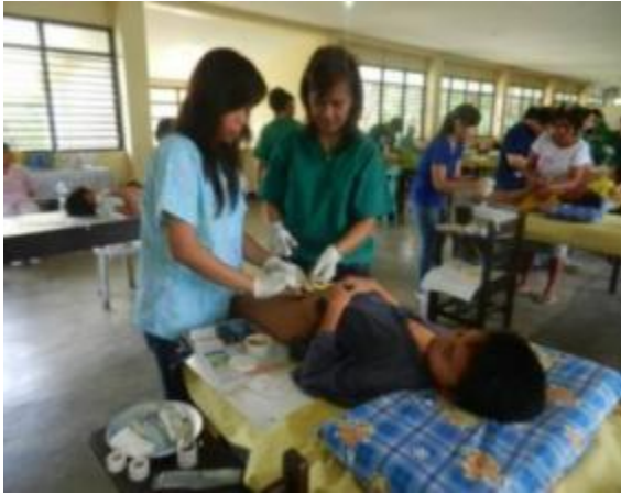
Circumcision mission was carried out, free of charge.