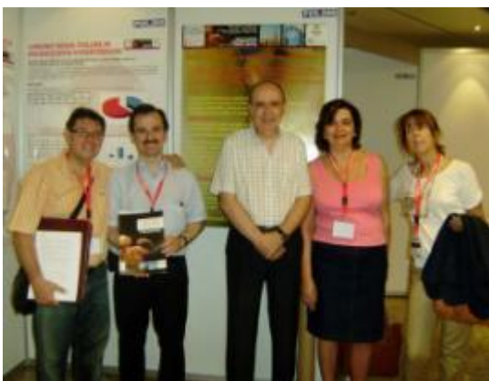
Spanish group in front of poster: Workshop on breast feeding in primary health care