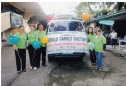
Start of celebration – Pagadian City

PAFP recognizes this welcome development and was at the forefront of various activities, including lay fora (15 chapters), commemorative masses (seven chapters), free consultations with medications (18 chapters), exercise program / walkathon (four chapters), cholesterol /glucose screening/bone densitometry/immunization (four chapters), lecture/seminar (three chapters), breakfast and bonding with families (three chapters), poster presentation / AVP / flyers (three chapters), circumcision mission (Las Pinas and Taguig), a radio broadcast (Zamboanga del sur), and motorcade (Manila and Pagadian).