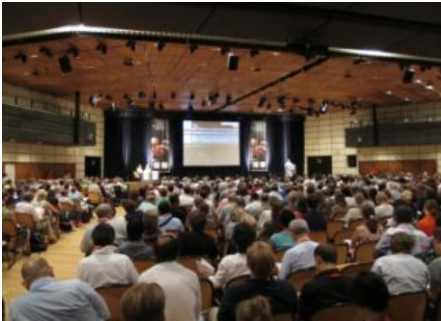
The plenary hall