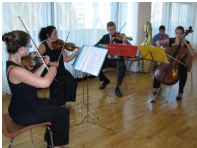
Music was always in the background