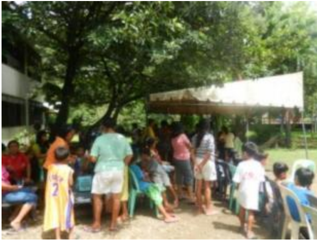
Numerous patients waiting for their turn in makeshift areas.