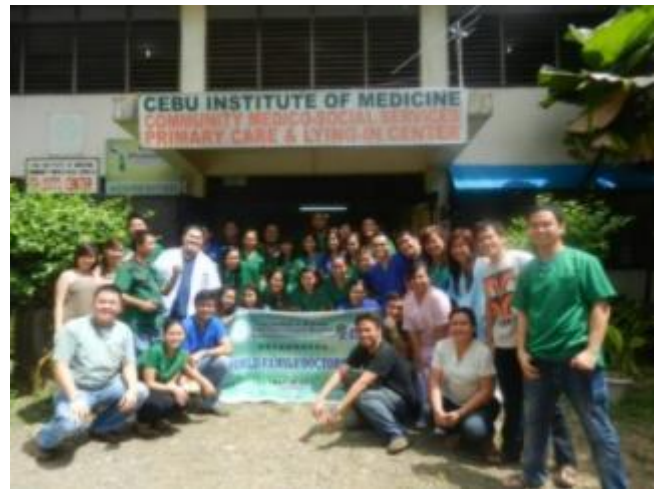
It was indeed something to cheer about in Cebu.