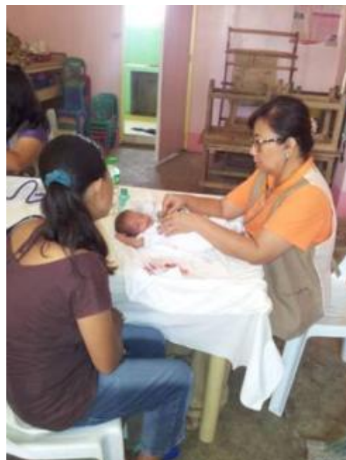
Consultations were offered free by PAFP member doctors