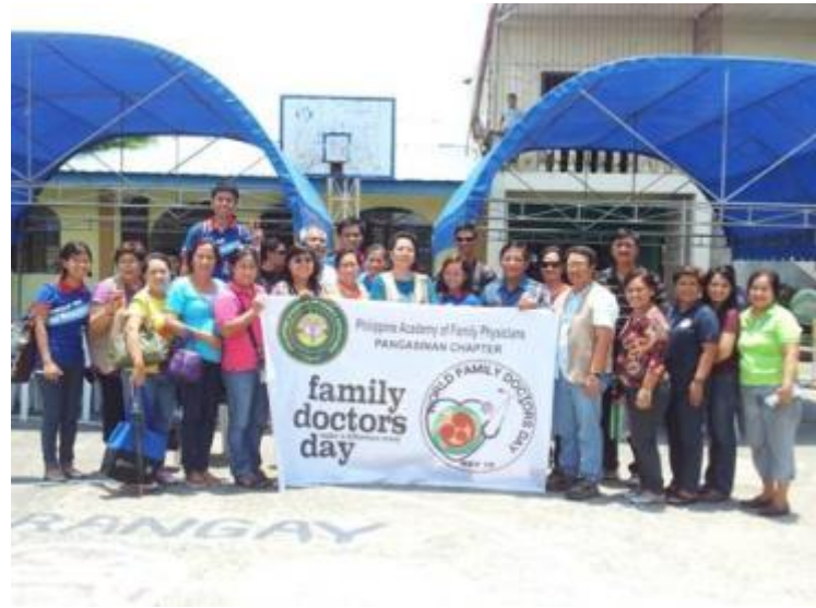
Posing after a job well done in Pangasinan