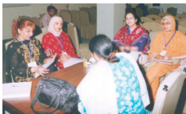
Doctors sitting the MRCGP[INT] exam in South Asia

professionalism were owned by all. Research methodology and practice management were felt to be less relevant.