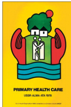
Logo of the 1978 Alma Ata Conference and Health for All Declaration

The World Health Report 2008 will be devoted to one of the World Health Organization’s (WHO) priority areas, the reinvigoration of primary health care. Publication of the World Health Report on Primary Health Care is scheduled for mid-October 2008. The report will be launched 30 years after the watershed international conference on primary health care at Alma Ata (now Almaty, in Kazakhstan) and the historic Alma Ata Declaration for ‘Health for All’ by the year 2000.