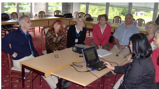
Small group work facilitated by one of the course directors is the cornerstone of the EURACT Bled course.