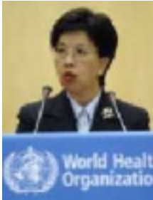
Dr Margaret Chan, WHO Director General

said, I want us to be judged by the impact we have on the health of the people of Africa, and the health of women. Improvements in the health of the people of Africa and the health of women are key indicators of the performance of WHO.”