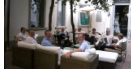
ICFPRN Members relax during the busy Wonca Europe Regional Conference