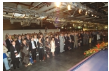
Delegates sing the National Hymn during the opening ceremony