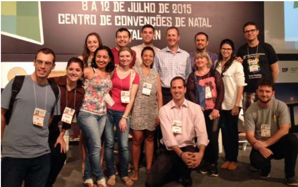
Photo: WONCA President with young family doctor members of the Brazilian Society of Family and Community Medicine

family health teams of doctors, nurses and community health workers, each providing comprehensive clinic-based and home-based care as a team to a defined population.