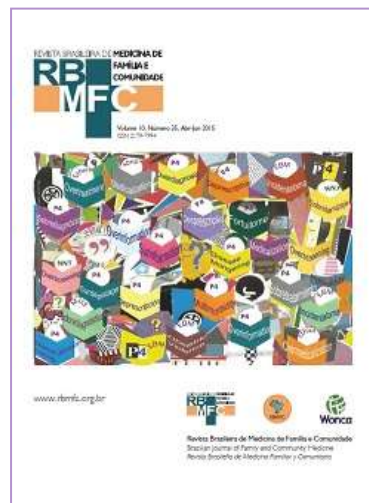
Table of contents of "Quaternary Prevention (P4)"

The articles are in English, Portuguese and Spanish so can be of interest to all.